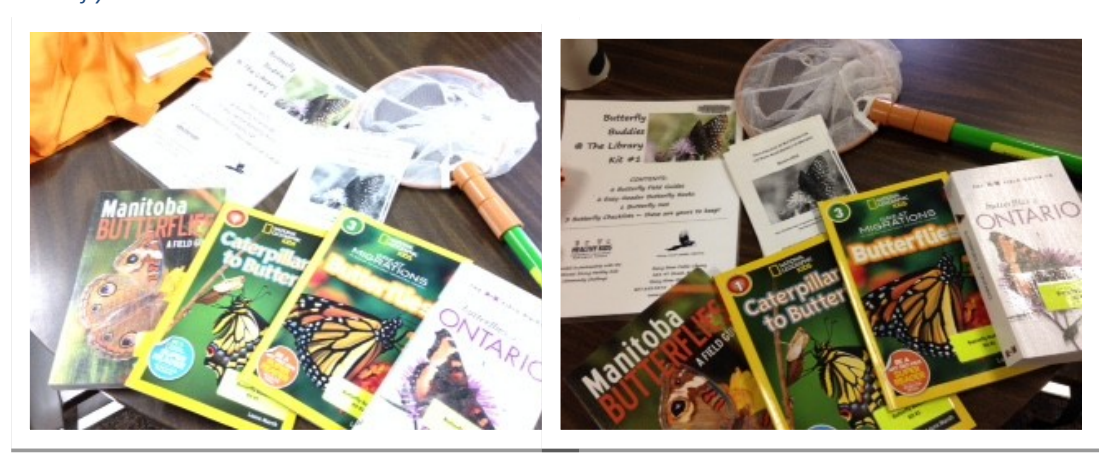
Figure 3: Butterfly Buddies Kits

In addition to tourism, agriculture plays a significant role in the area's economy. Once again, the library has responded to this economic driver by developing a collection with a specialization in this sector. Small family farms and a growing Mennonite community have created demand for information and materials related to the 'local food' movement and the related growing, harvesting and marketing of locally grown foods. By partnering with the local chapter of the Ontario Federation of Agriculture, which provided a donation and advice on topic areas, the library has been able to add significantly to its agriculture-focused collection.