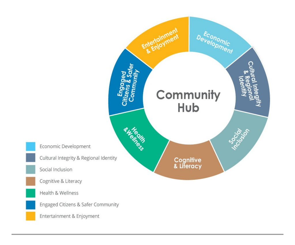
Figure 2: Measurement Framework